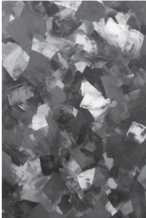
Figure 3.2. Singularity of being: after Lacan (Artist: Inés Hernández-Ávila, © 2015).

It is possible that the ancient Nahuatl philosophers thought of poetry as the path to truth because the energy that is called upon to create is a call to dialogue with God (or the Mystery, the One of many names) in your heart (León-Portilla 1990,