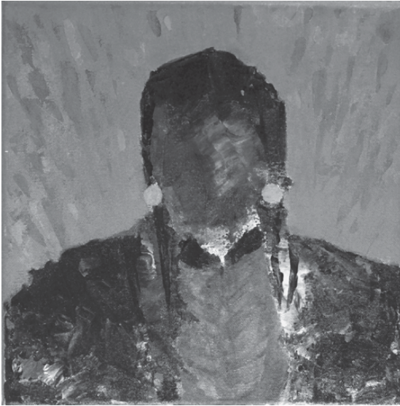
Figure 3.1. Visit from Chief Joseph.

of this hemisphere now known as the Americas. The earth holds us in her memory just as we hold her in ours. While it may seem strange to Westerners, Indigenous peoples understand that the earth, a sentient being, not only has memory, but she also has been and is witness to all that happens on her body—the earth knows history, writ large, just as our own bodies hold and know memory and history.