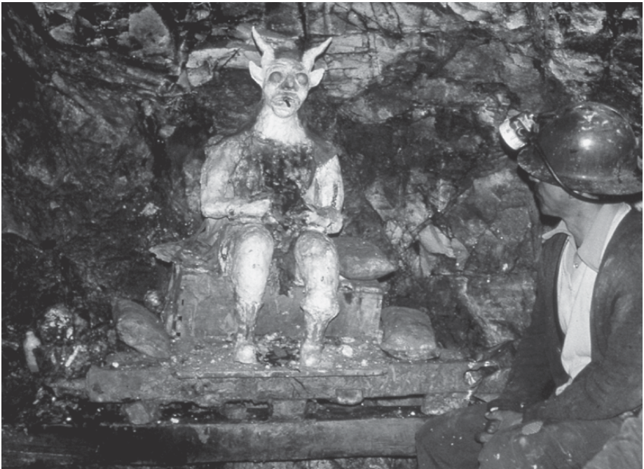
Figure 7.2. Tío or Supay , placed 380 meters down in the Moroqoqala tin mine in Bolivia.

If we scratch through the layers of mythical time, Supay is related to an ancient Andean god Huari , whose other name is Qöqena , a fertility god sculpted in the shape of Andean camelids who, confronted by the arrival of a new god in the sixteenth century, chose to hide the riches in the Uk'u Pacha , the World of Below, to survive and rule. Supay or Tío is therefore a guardian of the riches, a clear symbol of fertility and reproduction, a phallic deity. The underground god mediates a reciprocal exchange of damage for restoration, by granting riches and being fed.