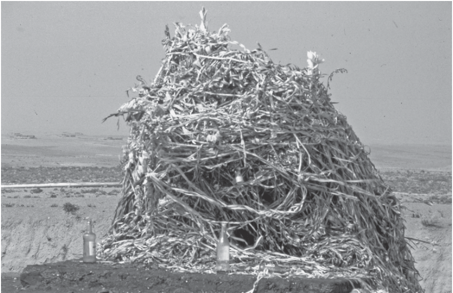
Figure 7.1. A Wak'a of the Pachapurichej on the Oruro–La Paz route. Sojourners, herders, and modern travelers stop to offer libations.

To keep a Wak'a alive, 4 Andean devotees travel long distances to salute and feed them following the commendations of spiritual leaders. For example, Mount Illimani, in today’s city of La Paz, Bolivia, is considered to be the Jach'a Wak'a , Jach'a Apu , Inka Achachila (major Wak'a , major Inka Achachila ) amid the ones found in the area who have proper names: Mururata , Illampu , Wayna Potosí , Janq'uma , Sajama , Chörölque , Quimsa Cruz , Chakalt'aya , Ch'uruq'ella , Siga-siga , and the like. Healers, or specialists of the sacred, 5 called Chamaq'anis are in charge of rituals offered to such entities, since they have the power to talk and to listen to them in the dead of night—hence the term Chamaq'ani , is translated as “those who sense animated energy K'ama in darkness.” All these ritual activities resonate with the desire to heal the sustained damage inflicted by enduring anthropogeny. In this sense, the healers’ activities, in their many specialized forms, end up affirming the earth’s politics of mutual bioregeneration. 6 The healing of the eARTh reflects the spiritual awakening of the human but no longer as the center of a “dominated” planet.